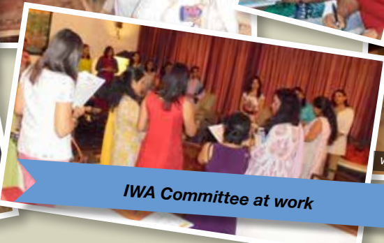
IWA Committee at work