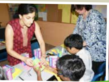
KidzVenture Goes Green