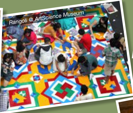
Rangoli @ ArtScience Museum