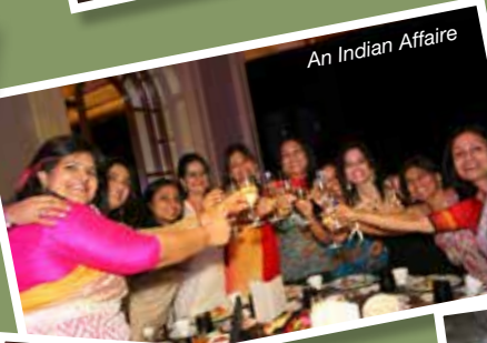
An Indian Affaire