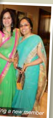
welcoming a new member